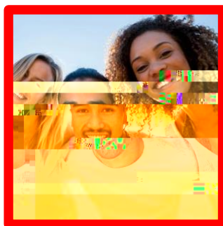
Multiple People in Photo