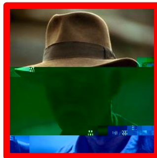
No Hats or Sunglasses