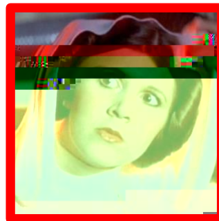
Busy/Dark Background Not Looking at Camera