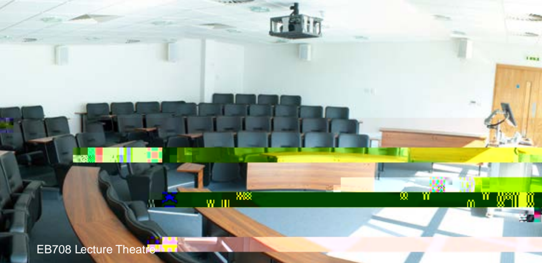
EB708 Lecture Theatre